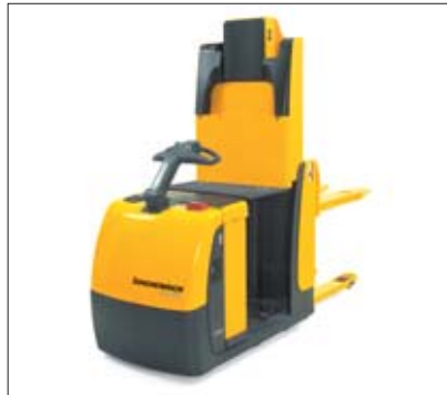
Order picking from second racking level with raised stand-on platform