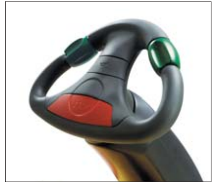
JetPilot – exclusive for Jungheinrich