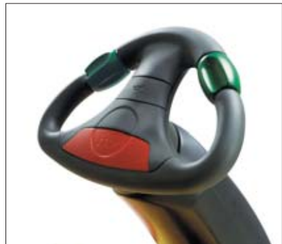
JetPilot – exclusive for Jungheinrich

Different steering concepts facilitate tailor-made application: