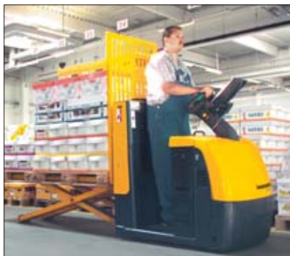
Comfortable travel and fast order picking

The Jungheinrich impulse control "Speed-Control" facilitates comfortable, safe travel with adjustment opportunities for every application: