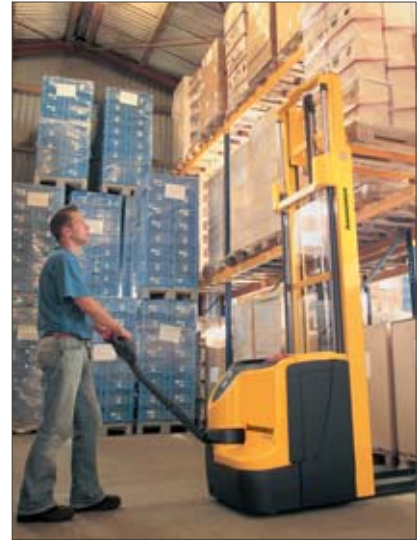
Excellent visibility through slim mast