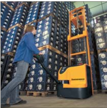
High residual capacities promote truck versatility